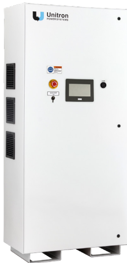
FIXED CONFIGURATION (Shown with standard touch screen front panel)