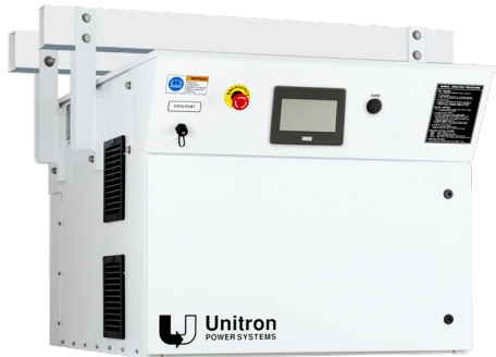
BOARDING BRIDGE CONFIGURATION (Shown with touch screen front panel)